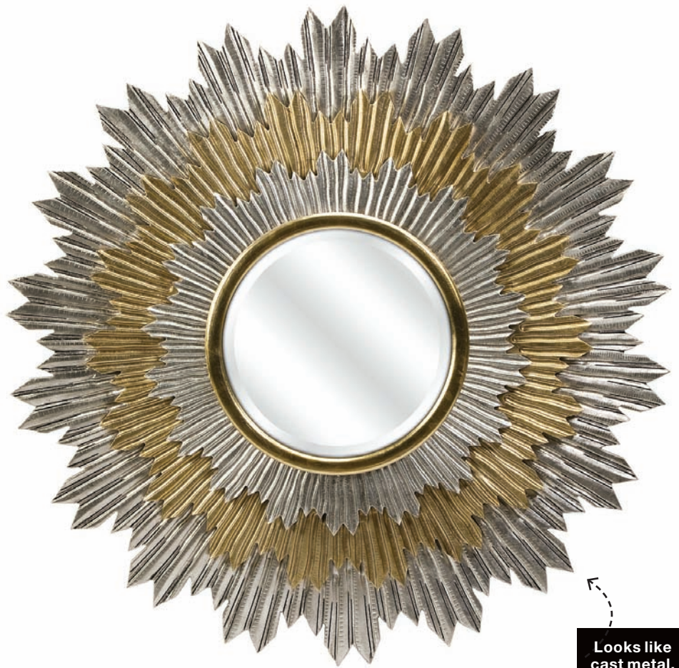
Mixed Media: 47-inch hand-carved wooden sunburst mirror with hand-applied silver leaf. McNabb & Risley, Thiensville

Here are some of our favorites from local retailers.