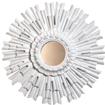
White Hot: 20-inch white sunburst mirror cast from an antique and finished in high-gloss paint. Ethan Allen, Brookfield

Looks like cast metal, but it's made of wood.