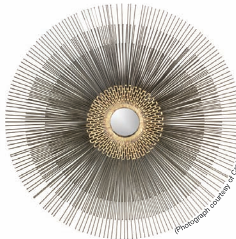
Midcentury Mod: 30-inch starburst wall mirror made of steel spring wire with brass powdercoat finish. Crate & Barrel, Wauwatosa

The sun and all its forms are renowned symbols of Louis XIV, France's famed "Sun King."