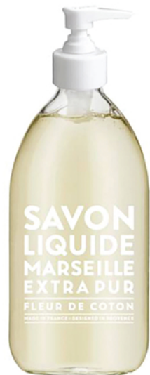
Treat your guests to luxurious hand soap in subtle scents.