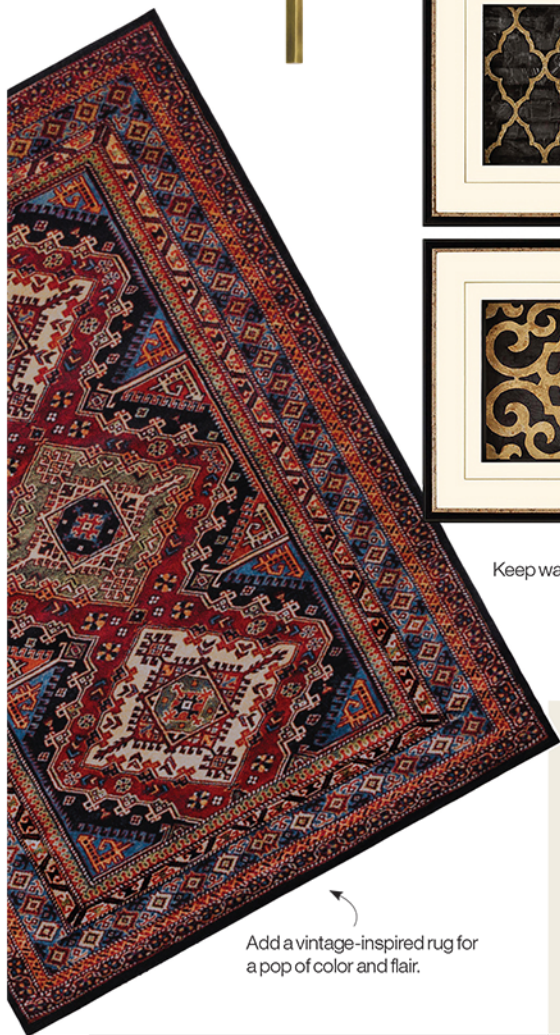
Add a vintage-inspired rug for a pop of color and flair.