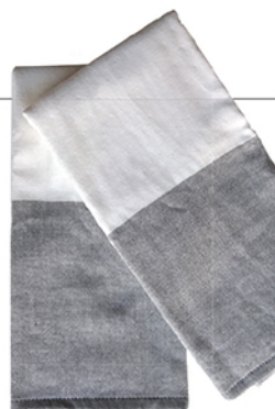
Satisfying both form and function, use pretty hand towels in luxe fabrics.