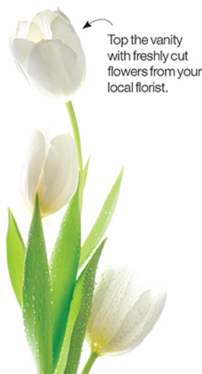
Top the vanity with freshly cut flowers from your local florist.

Clockwise from wall art: Set of four framed prints, McNabb & Risley Fine Furniture and Interior Design , mcnabbandrisley.com ; Kassetex hand towels, The Home Market , shophomemarket.com ; Savon de Marseille liquid soap, The Home Market ; area rug, McNabb & Risley Fine Furniture and Interior Design ; Kichler one-light wall sconce, BBC Lighting , shopbbclighting.com