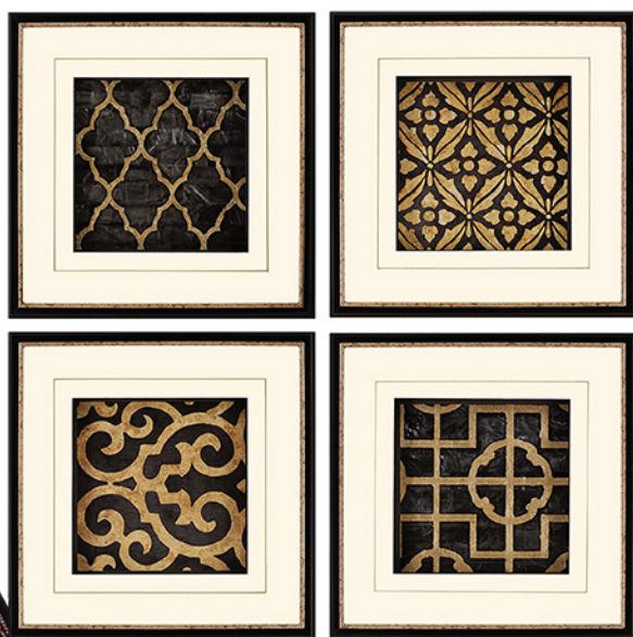
Keep wall art neutral colored — but still visually stunning.